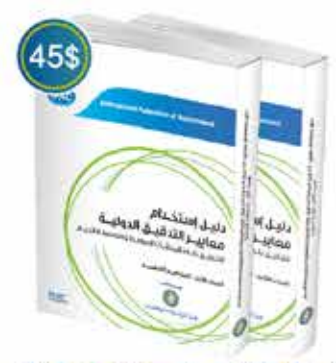
دليل إستخدام معايير التدقيق الدولية للتدقيق على المنشأت الصغيرة ومتوسطة الحجم – الإصدار الثالث (جزنين)