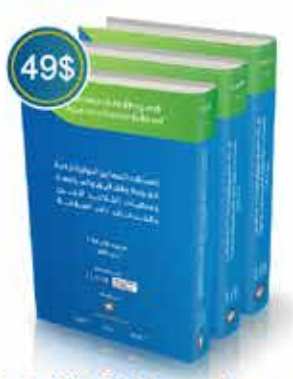
إصدارت المعايير الدولية لرقابة الجودة والندقيق والمراجعة وعمليات التأكيد الأخرى والخدمات ذات العلاقة ٢٠١٨