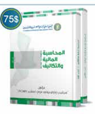
منهاج محاسب دولي عربي اداري معتمد "IACMA"