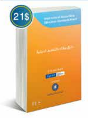
دليل بيانات التعليم الدولية ٢٠١٧