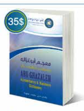
معجم أبوغزاله للمحاسبة والأعمال - الطبعة الثالثة