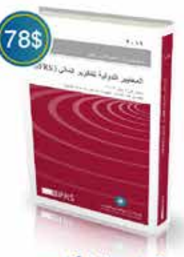
المعايير الدولية لإعداد التقارير المالية ٢٠١٩