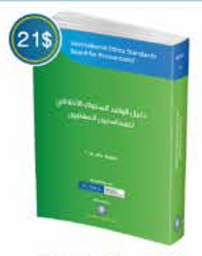
دليل قواعد السلوك الاخلاقي للمحاسبين والمهنيين ٢٠١٨