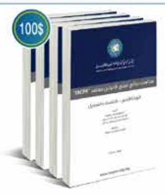
منهاج محاسب دولي عربي قانوني معتمد "IACPA"