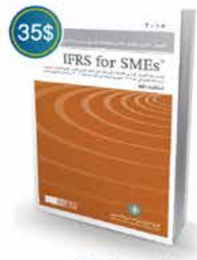
المعايير الدولية لإعداد التقارير المالية في المنشآت الصغيرة ومتوسطة الحجم ٢٠١٥