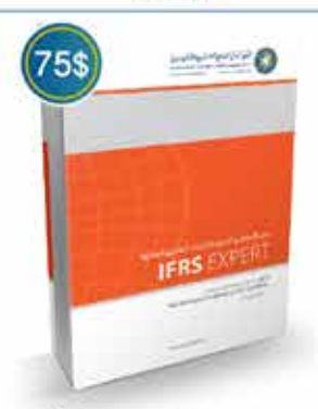
منهاج خبير المعابير الدولية لإعداد التقارير المالية "IFRS Expert"