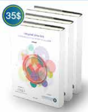
إدارة مخاطر المشروعات التكامل بين إدارة مخاطر المشروعات والاستراتيجية والأداء