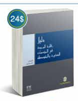
دليل رقابة الجودة في المؤسسات الصغيرة والمتوسطة الإصدار الثالث