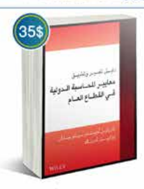
دليل تفسير وتطبيق معايير المحاسبة الدولية في القطاع العام